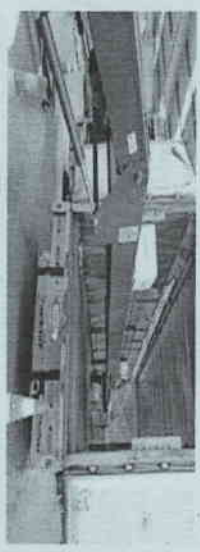
AUTOMATIC TRUCK LOADING SYSTEM